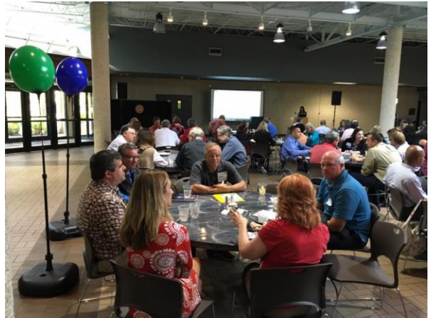
Networking at monthly chapter meetings.