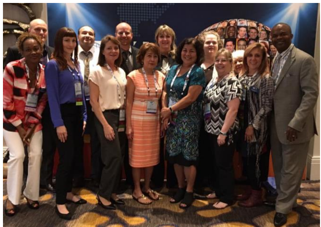
Some of the 2016 board members attending a PMI leadership event.